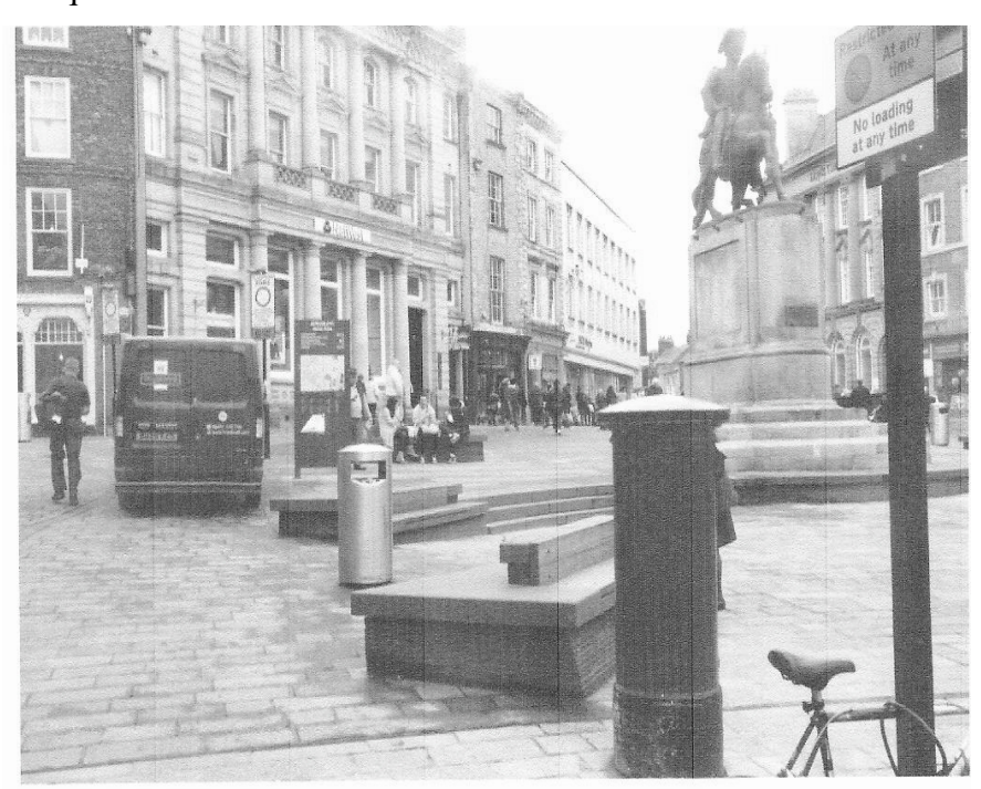
Postman leaving van to deliver mail in Saddler Street

processed, since the County Council was both promoter of the scheme and the planning authority responsible for considering it. Although the listed building elements of the planning proposals were statutorily referred to the Secretary of State for ultimate determination, paradoxically this referral diminished public accountability by taking the decision-making on the listed building applications outside the jurisdiction of the Local Government Ombudsman - and also beyond the likely scope of a successful application for Judicial Review. The QC's advice which the Trust received was that,